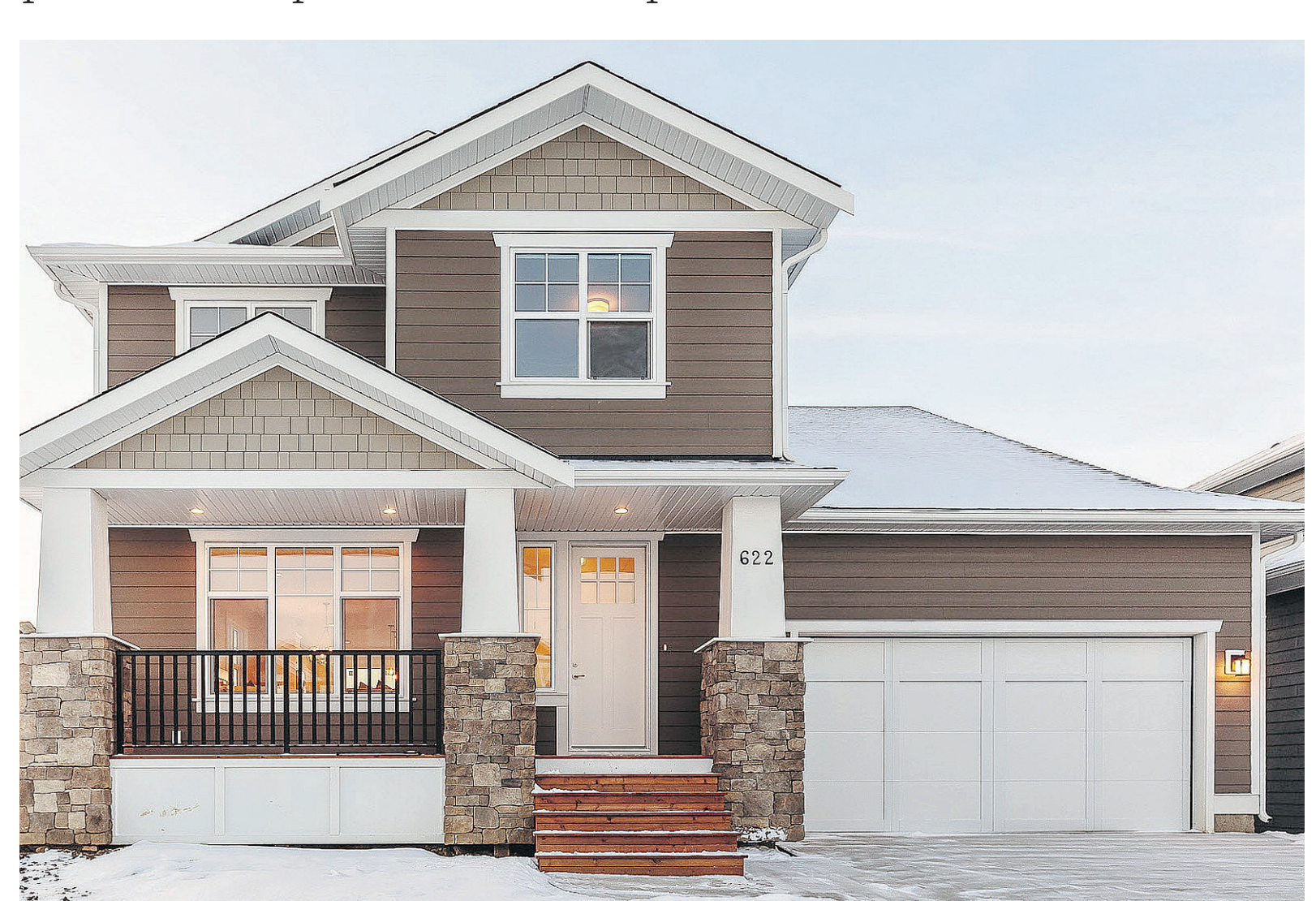
Arbutus Properties' new "Ford" model home, at 622 Meadows Blvd., in The Meadows, will satisfy buyers who want a super-sized garage. The home offers a four-car, double-wide, double-deep attached garage. From the street, the garage looks like any other double garage.

Torlys wide-plank laminate flooring in a light oak tone extends throughout the great room, bringing warmth to the home's white walls and cabinetry.