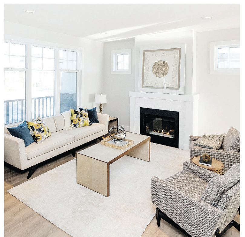
The show home's 2,133-square-foot interior offers an enticing Craftsman Industrial design. The living room's focal point is a natural gas fireplace dressed with tumbled white marble tile.