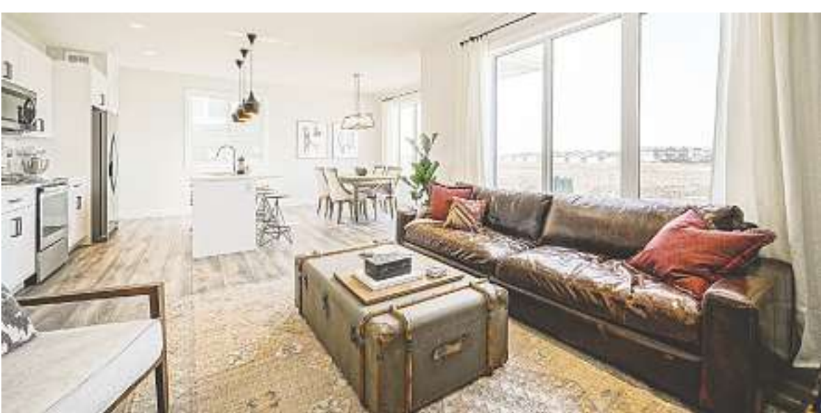
The open layout, nine-foot ceilings and oversized, triple-pane windows contribute to a spacious, inviting feel.

The Clarke show home is open for viewing Saturdays and Sundays from 1 to 5 p.m., and from 4 to 8 p.m. on Tuesdays, Wednesdays and Thursdays. For more details, visit www.meadowsliving.ca