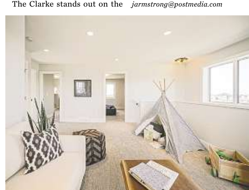
The second-floor bonus space is an area for family fun and relaxation.