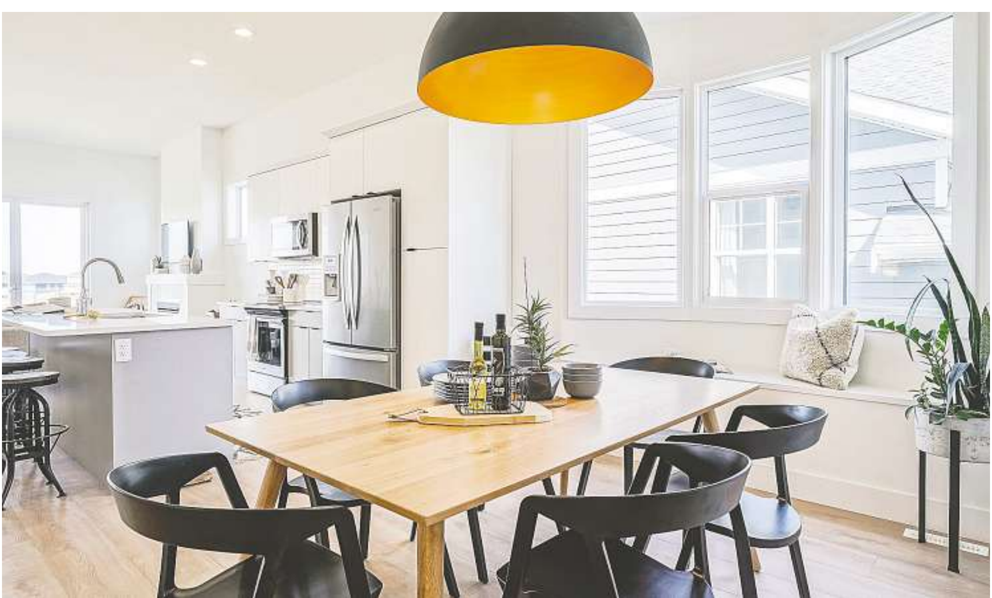
A large bay window with a window seat brings natural light from three directions into the great room of Arbutus Properties' Brady bi-level show home.