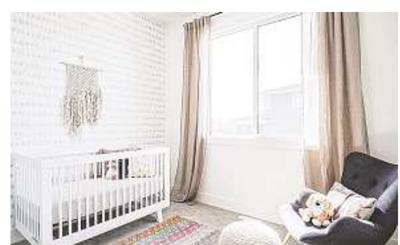
The Brady floor plan features two bedrooms on the main floor with the master suite located on its own level in the bonus space above the garage.