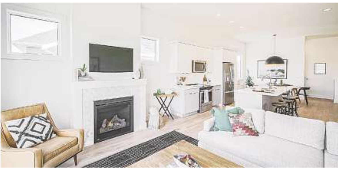
The Brady's bi-level floor plan makes the most of open-concept design with the show home's great room extending the length of the house and featuring ceilings that are more than 10 feet high.

The main floor of the Brady exemplifies open-concept design. The great room extends the full length of the main floor with ceilings that are 10 feet seven inches high.