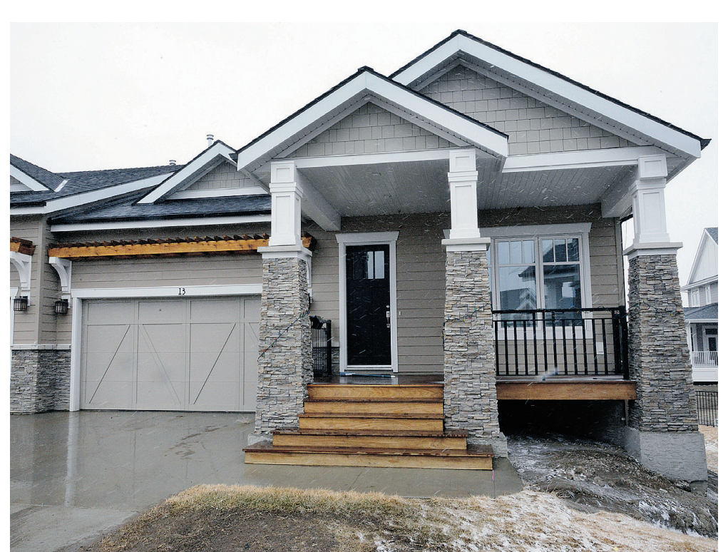
Sterling Gate by Arbutus Properties offers semi-detached walkout bungalows in the craftsman style. The front porch is an invitation to linger with neighbours.