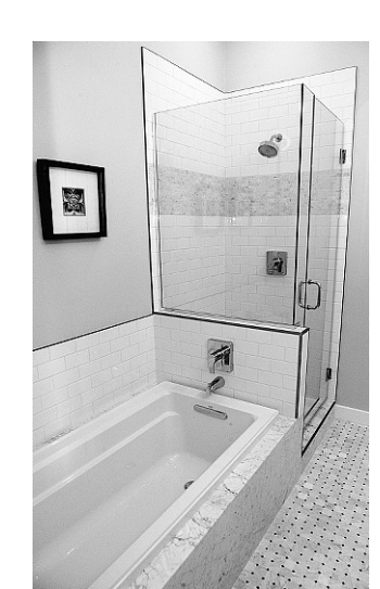
A tiled glass-enclosed shower and tub create a beautiful ensuite for pampering.

Designed for full security and luxury, residents will enjoy a gated community, manicured lawns and privacy fencing. Residents will