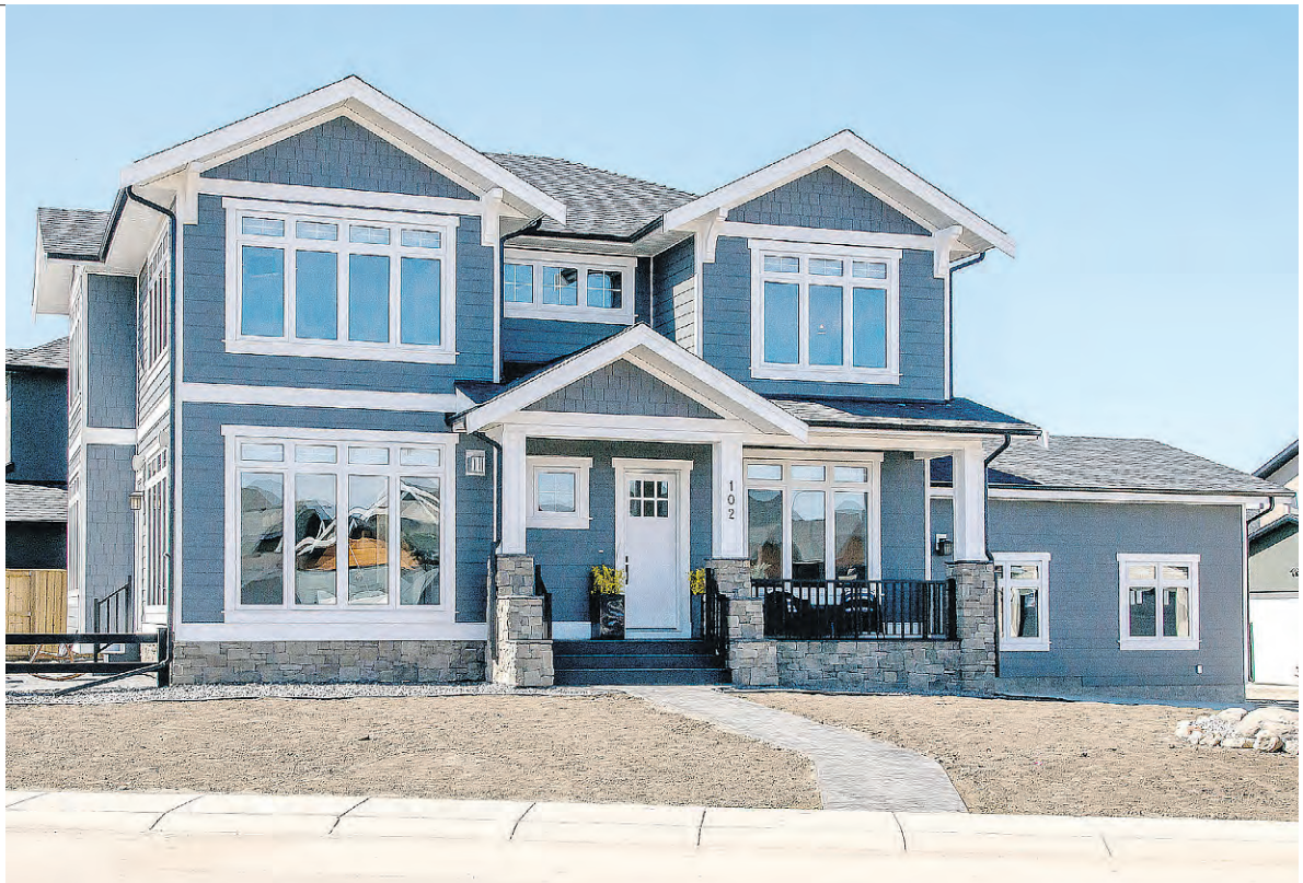
This 3,927 square foot family home at 102 Sinclair Cres., featuring an envy-inducing indoor rink, is one of two show homes by Arbutus as part of the 2016 Kinsmen Winner's Choice Home Lottery.

ice advantage to the next level. It's complete with goal nets and a goal light. There's even a VIP viewing lounge where your family and friends can watch all the action.