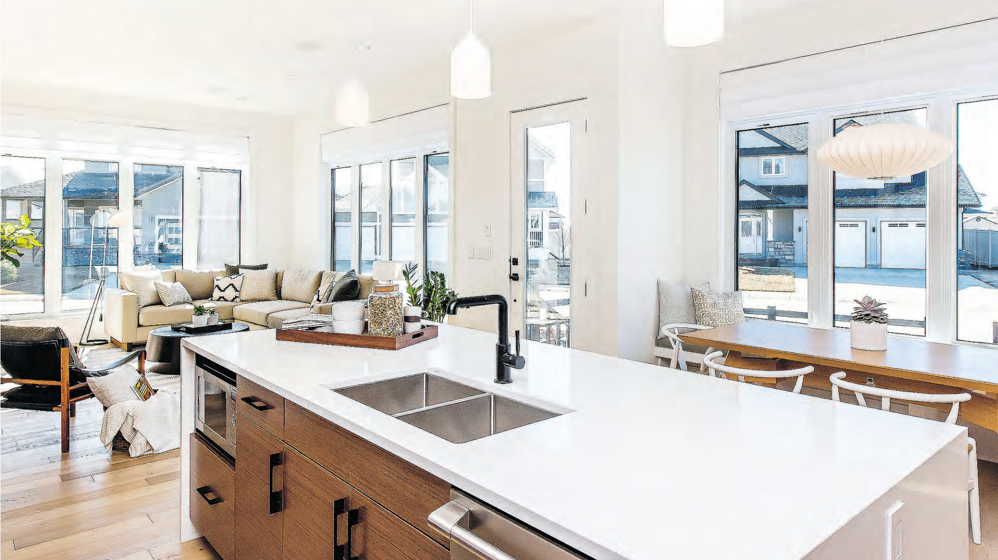
The kitchen features an open concept space with a huge island, plus an eating nook and family room with fireplace. Tons of windows add an airy brightness to the main level.