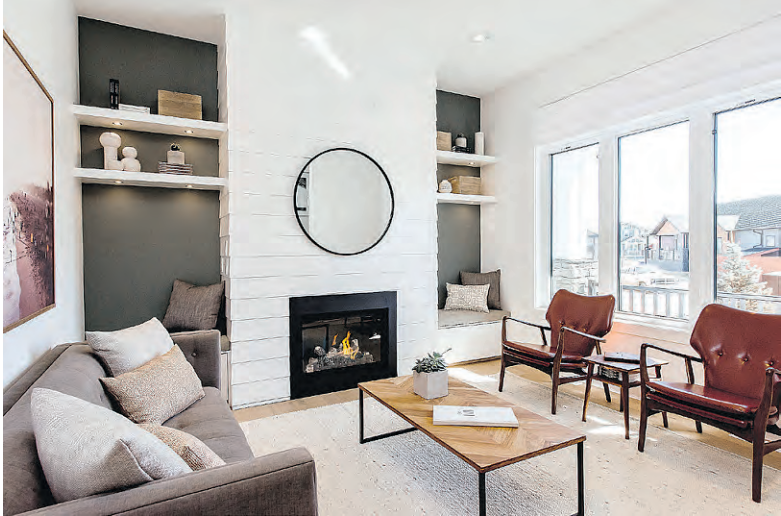
There are several gathering spaces in the home. This living room on the main level provides a comfortable space to welcome guests and visit before sharing a meal in the formal dining room or lacing up skates and trying out the indoor rink in the basement.

In addition to the luxurious family style home, the winner of the home lottery can choose the other show home — an executive style townhouse located at #21 — 115 Meadows Boulevard. The 2016 Kinsmen Winner's Choice Home Lottery show homes are open for viewing Wednesday to Friday from 6 p.m. to 9 p.m.; and weekends and holidays from noon until 5 p.m. jjacoby-smith@postmedia.com