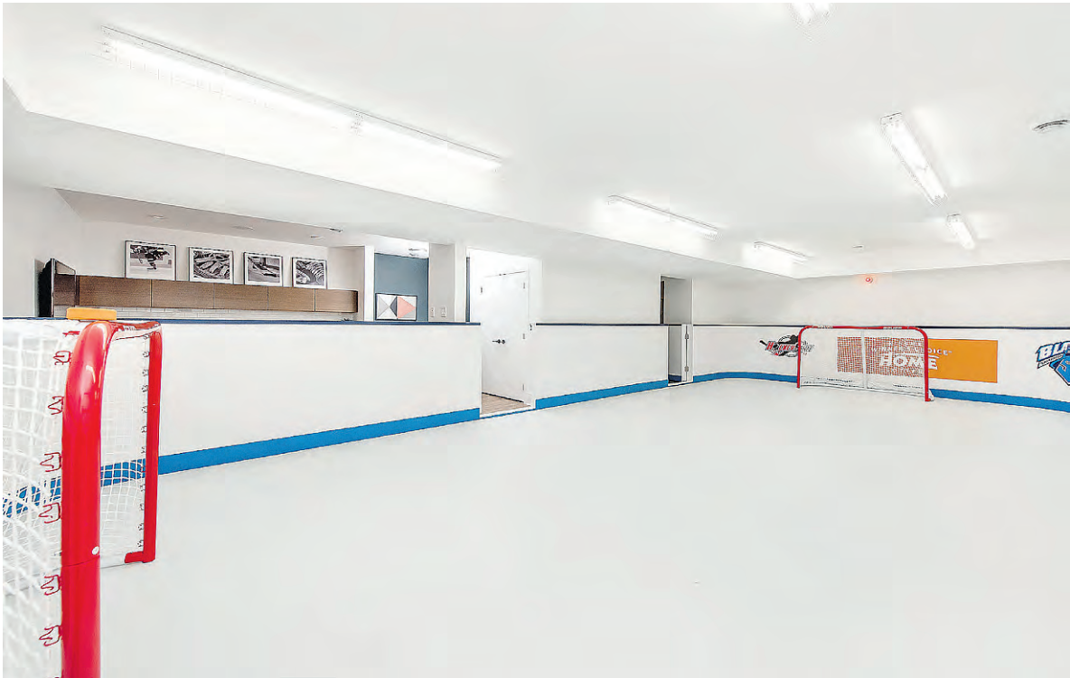
The indoor rink in the basement of 102 Sinclair Cres. utilizes a synthetic ice surface. It will make this house the envy of the neighbourhood. There are goal nets, goal lights and even a locker-room where you can lace up your skates. A VIP viewing box is also provided for family and friends to catch all of the action.

In addition to the luxurious family style home, the winner of the home lottery can choose the other show home — an executive style townhouse located at #21 — 115 Meadows Boulevard. The 2016 Kinsmen Winner's Choice Home Lottery show homes are open for viewing Wednesday to Friday from 6 p.m. to 9 p.m.; and weekends and holidays from noon until 5 p.m. jjacoby-smith@postmedia.com