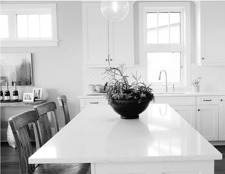
Sterling Gate is a 32-unit gated community in The Meadows at Rosewood. Built by Arbutus Properties, the community offers luxury-style executive homes.