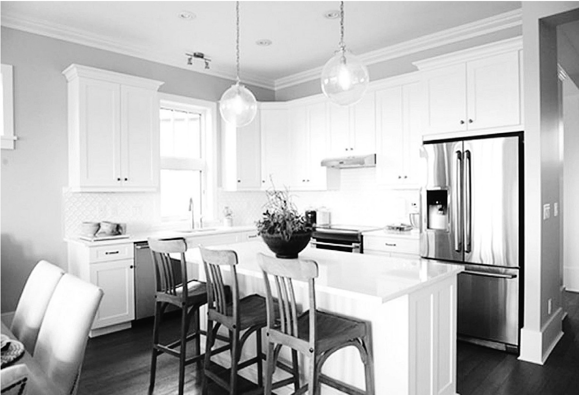
The community features two floor plans. The show home shows off the open living space of the Snowberry.