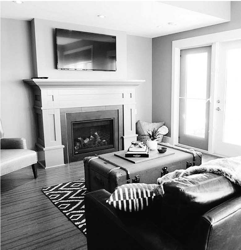
The Sterling Gate show home is located at #21, 115 Meadows Boulevard. There are only eight units remaining in the development.