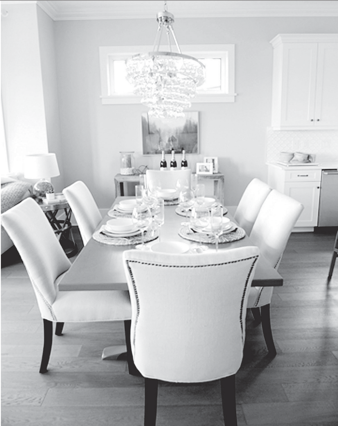
Throughout the main level, large windows let in tons of natural light.

The show home is located at #21, 115 Meadows Boulevard (follow signage) and is open for viewing Tuesday through Thursday from 5 to 9 p.m.; and weekends and holidays from 1 to 5 p.m. For more information about this gated community or to book a tour, visit MeadowsLiving.ca or call 306-291-8785.