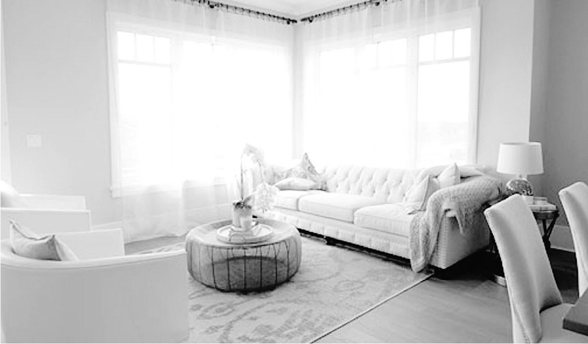
This show home features a walk-out basement which provides the perfect space for entertaining.