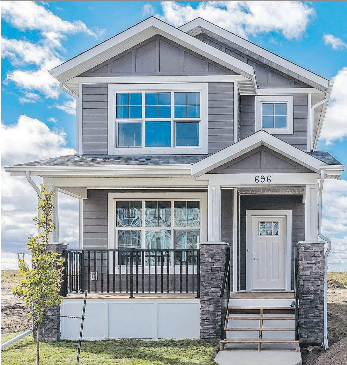
Arbutus Properties' Craftsman-style Morris show home located at 696 Meadows Blvd. is 1,392 square feet and is priced at $349,900. ARBUTUS PROPERTIES

Is your business showing up when it matters?