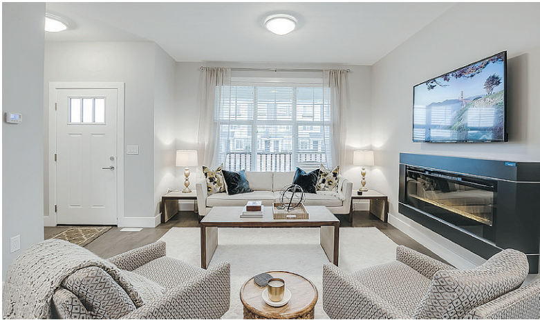
Above: The Morris show home has multi-generational appeal, proving popular with first-time and move-up buyers, as well as empty nesters. Below: Arbutus Properties' newest show home, The Morris, offers a bright and spacious open concept floor plan. Windows at either end of the great room bathe the space in natural light throughout the day.

The Morris is open for viewing weekends from 1 p.m. to 5 p.m., and from 4 p.m. to 8 p.m. Tuesdays through Thursdays. For details, visit www.meadowsliving.ca , jarmstrong@postmedia.com