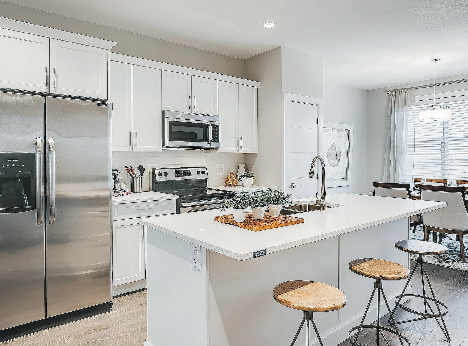
Arbutus Properties' Morris home features a large quartz island and quartz counters throughout.