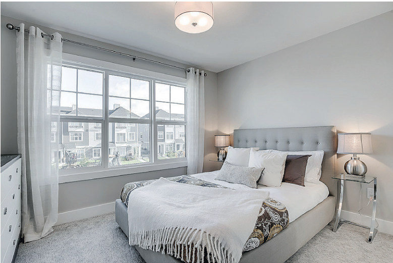
The master bedroom in The Morris is an inviting personal retreat, complete with an elegant ensuite and a generously-sized walk-in closet. The Morris show home is located at 696 Meadows Blvd.

Arbutus has designed the home with the potential for a legal suite in the basement. “There is a separate side entrance and plumbing for the suite is roughed in. Down the road, the homeowners can choose to build a revenue-generating suite or develop that living space for their own family,” says Minakakis. “With the new mortgage rules that are now in place,