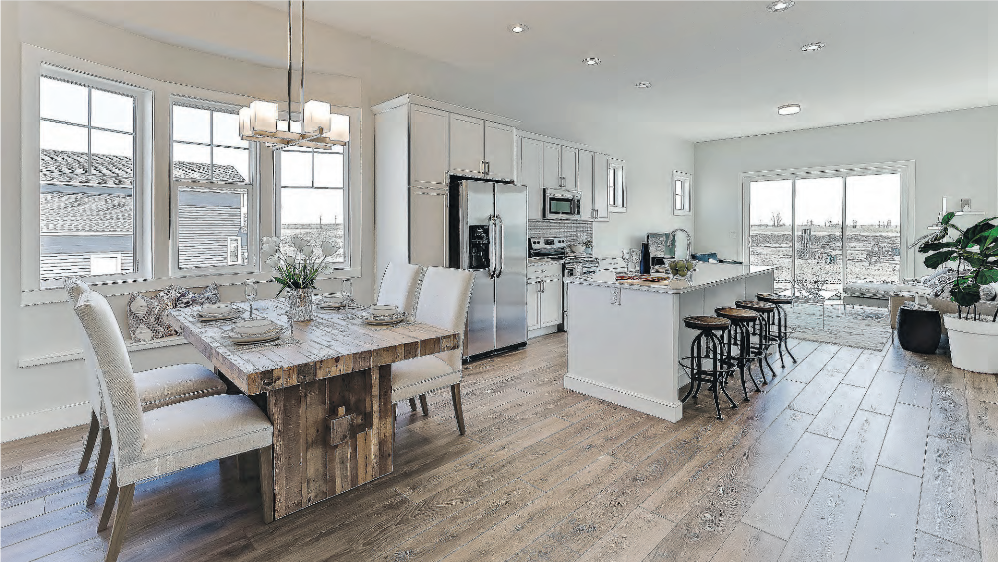
Main-floor ceilings soar to a height of 10-feet-seven-inches, giving an ultra-airy feel to an already open-concept area of the home.