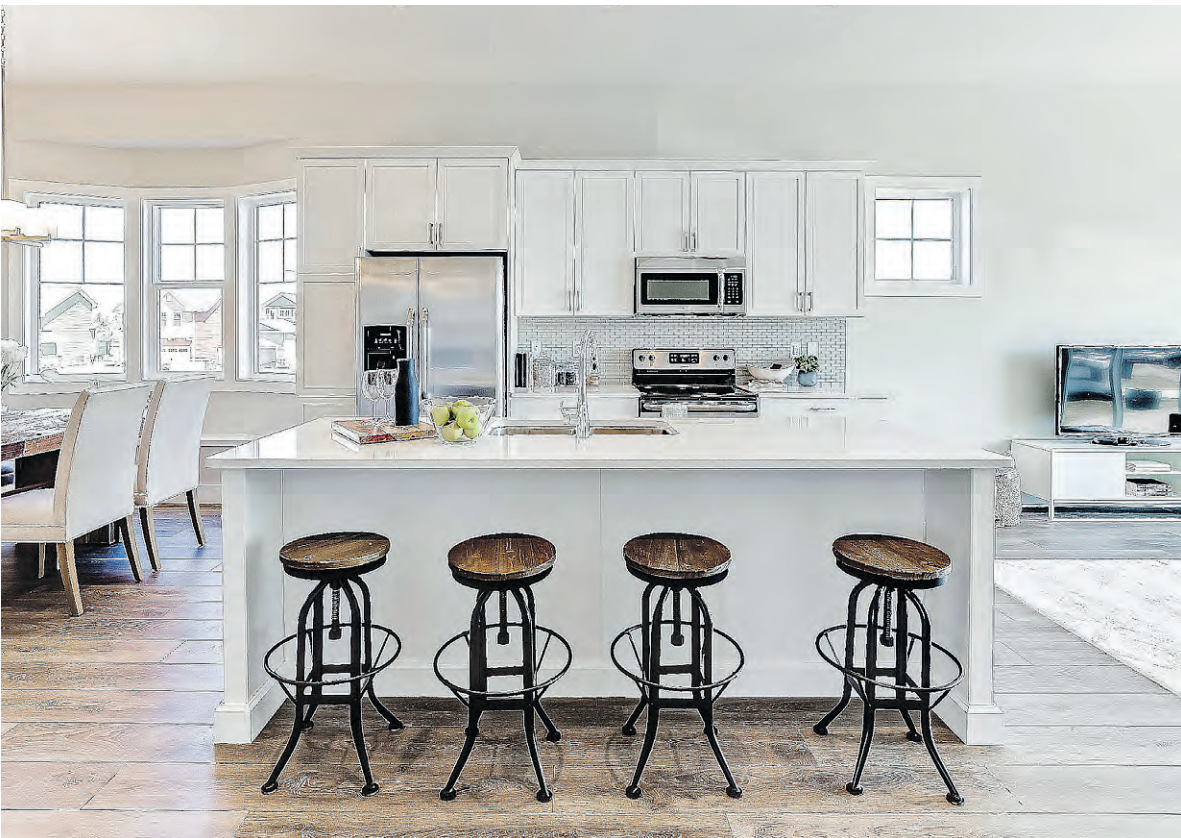
Arbutus Properties has unveiled its new bi-level model home, The Brady, located at 295 Eaton Crescent in The Meadows. The 1,475-square-foot bi-level features a gourmet kitchen that’s the hub of the main floor great room, with white Shaker-style cabinets and extended island.