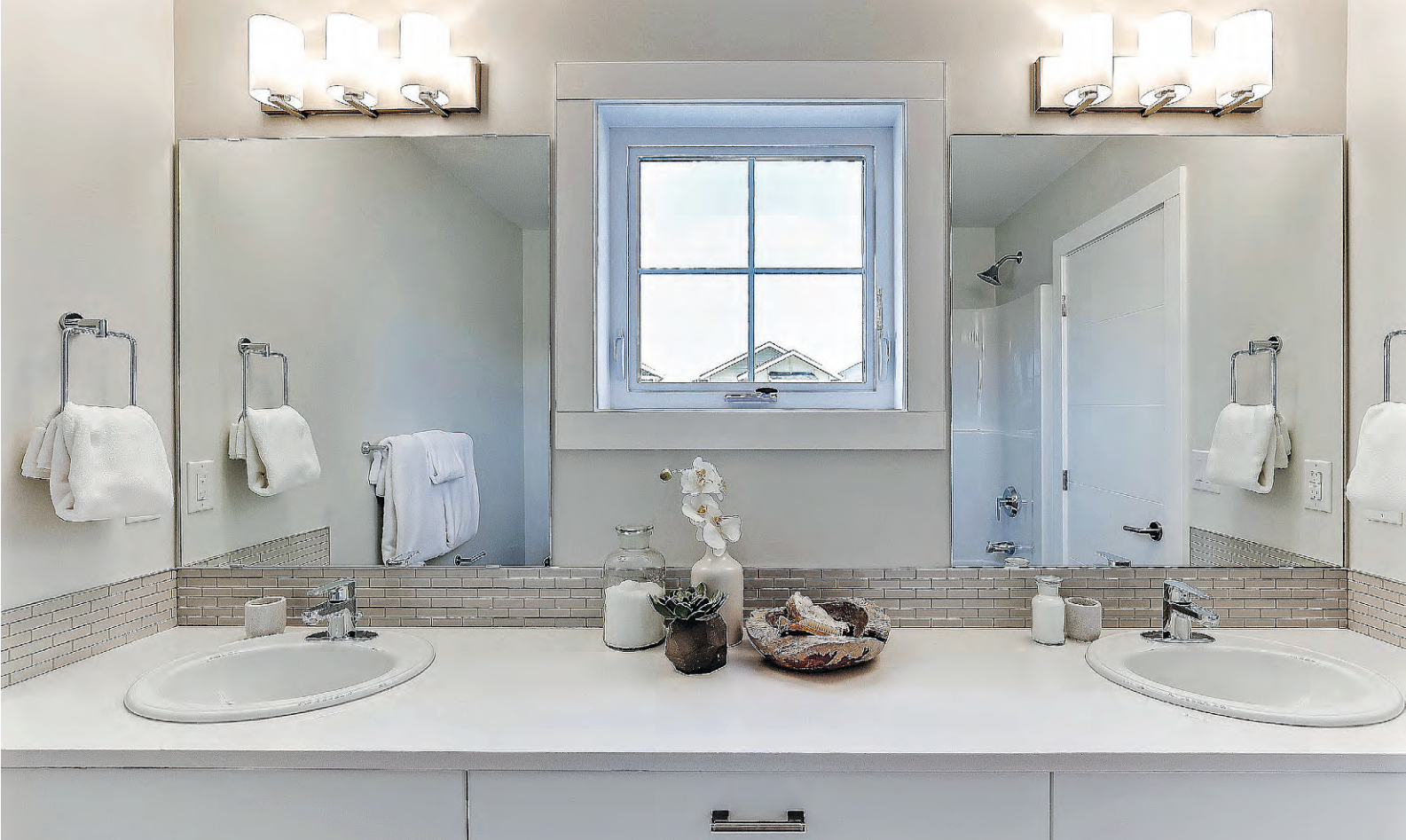
Off the spacious master bedroom is a large ensuite with a quartz-topped double vanity that has more than enough cabinets and drawers.

The Brady was designed to appeal to every demographic, he adds. “It could be a first-time homebuyer who is looking for a mortgage helper with a basement suite option. It could be a young family who wants to develop the basement to expand their own living space. We’ve also had inter-