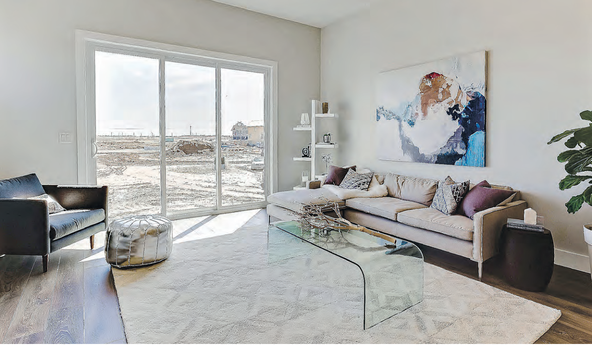
The Brady’s spacious living room has a three-panel garden door that floods the great room with sunlight.