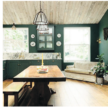
Couches in kitchens. DEVOL

"I think the kitchen has become much less of a place to simply just prepare and cook meals, and more of a space for family and friends to gather and cook together