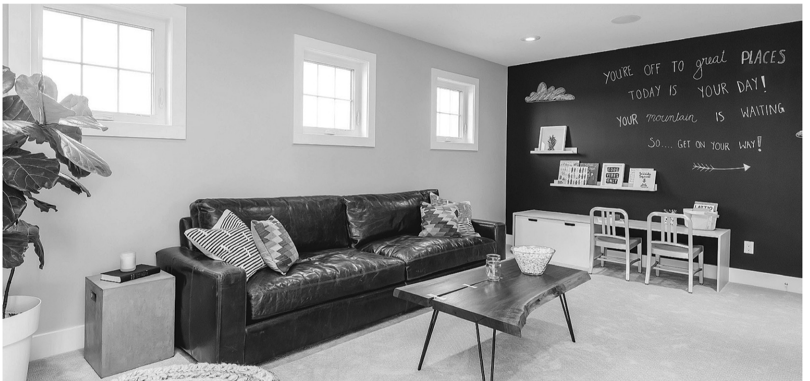
A large bonus room on the second floor of the James show home is an ideal space for a media room or children’s play area.