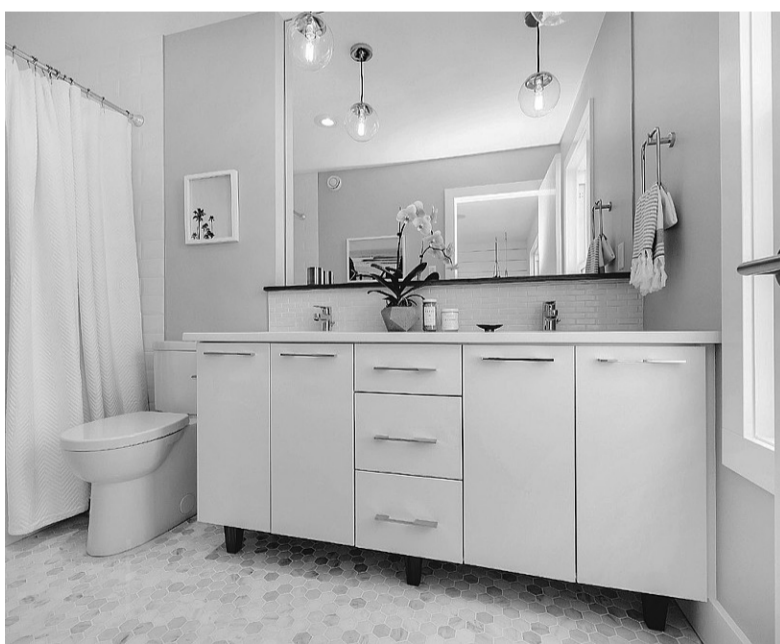
The parade home’s ensuite features accents of natural stone and wood. The floating vanity is topped with quartz and accented with a walnut ledge. The flooring is an elegant Nova Hex marble mosaic tile.