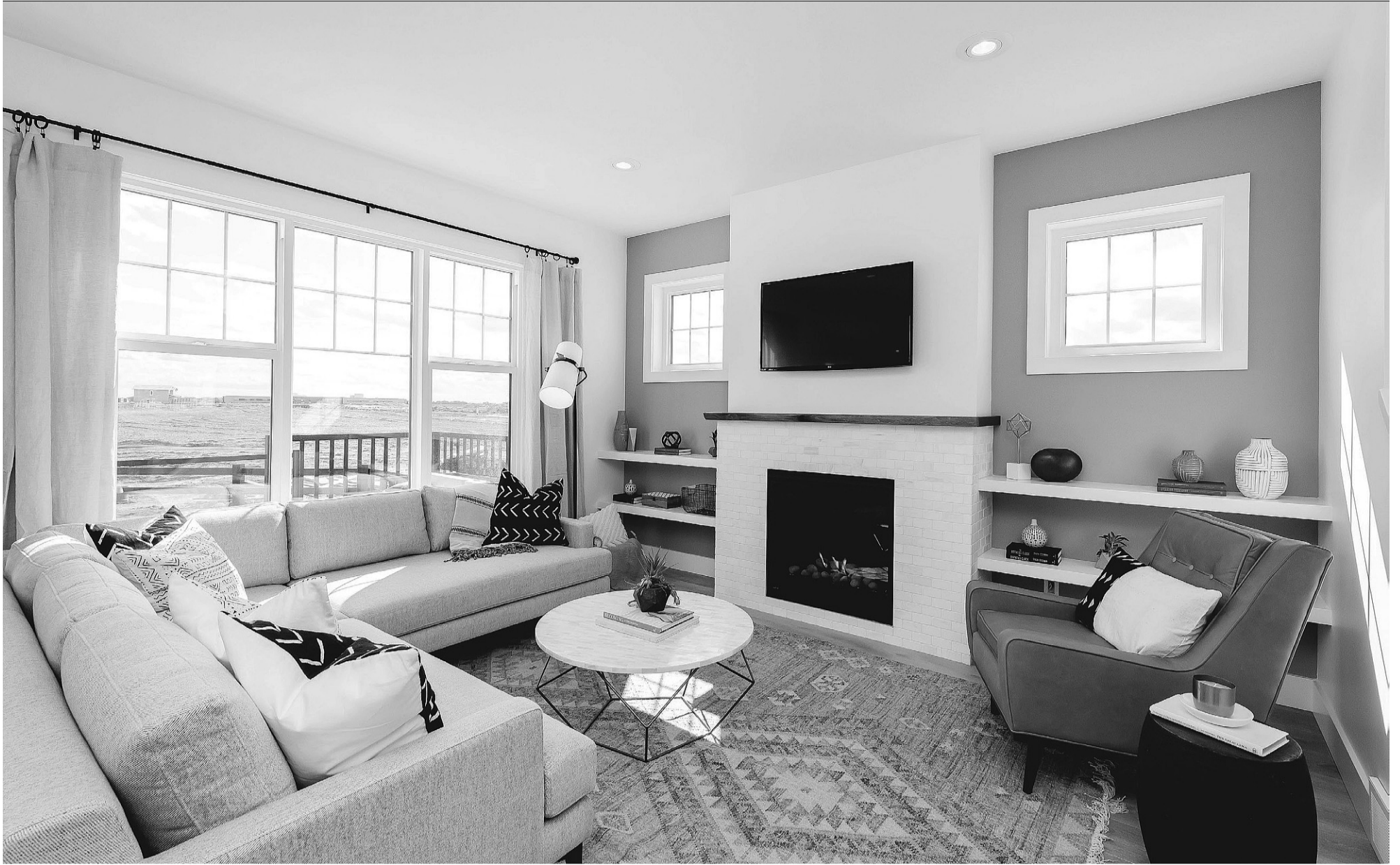
The James, a 2,020-square-foot, two-storey home, is a new design for Arbutus, embracing West Coast contemporary style.