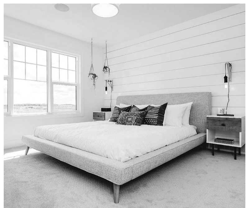
The master bedroom is bright and spacious. The shiplap feature wall is another expression of West Coast style.