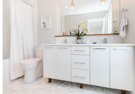
Walnut accents add warmth to the master ensuite of the James show home.