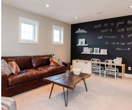
A large bonus space on the second floor makes for an ideal media room or kids' play area.

"We might have six or seven spec homes available at any given time. As you walk through each one, you'll see different design